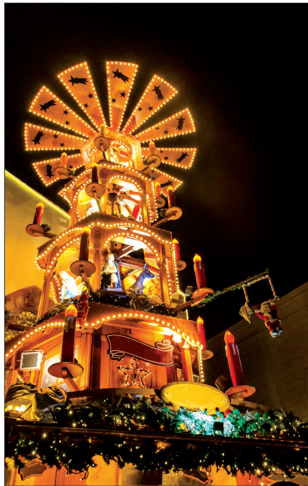
Explore Basel at the height of Christmas season